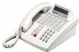
AVAYA / AT&T